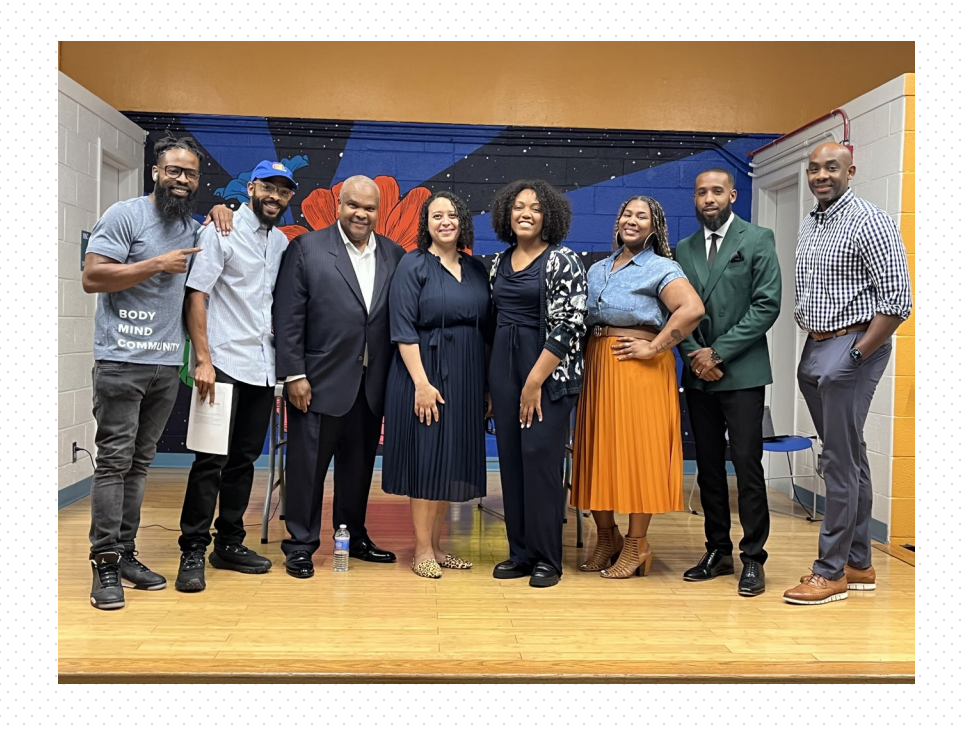
Father's and Finance w/ DPR on June 22nd