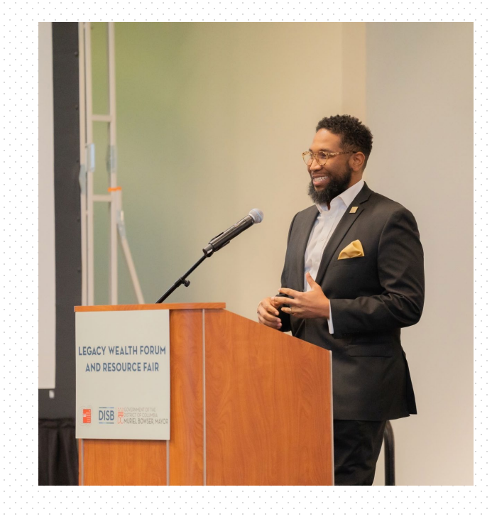
Legacy Wealth Forum and Resource Fair on April 24th