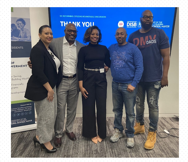
Returning Citizens Roundtable Discussion on April 28th