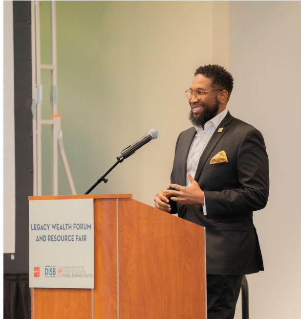
Legacy Wealth Forum and Resource Fair on April 24th