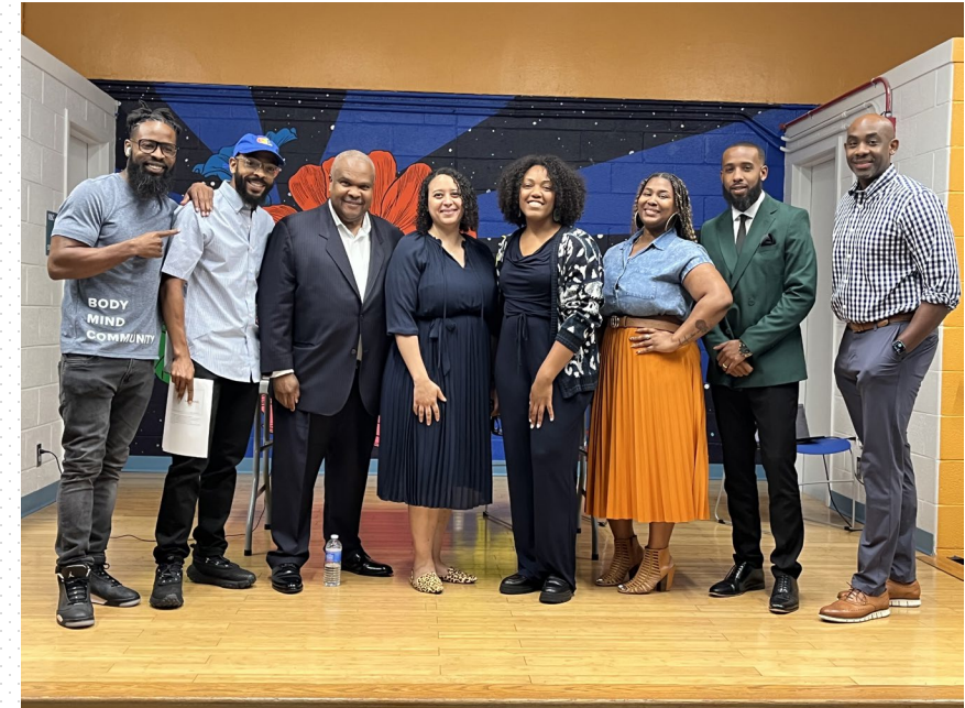
Father's and Finance w/ DPR on June 22nd