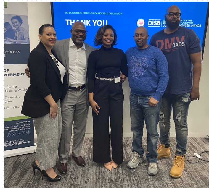
Returning Citizens Roundtable Discussion on April 28th